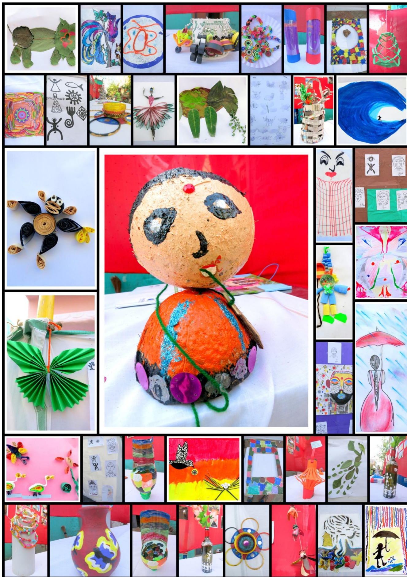
Crafts by children and young people exhibited during 28.12.2017