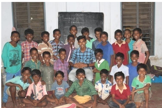
Std : VI