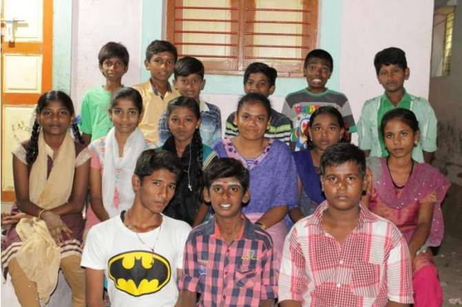
Std : VII