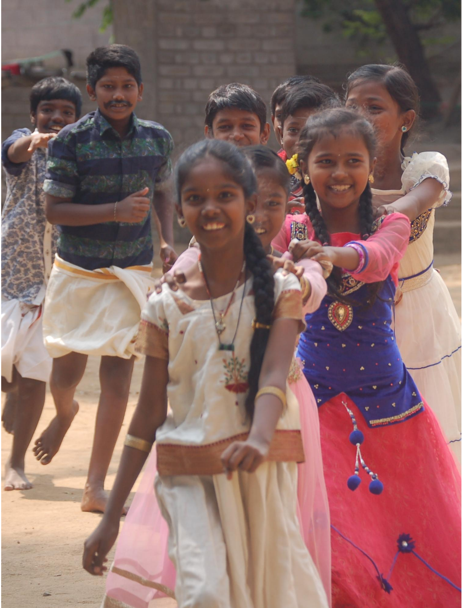
Children of “Tara and Grandma” drama rushing to the stage