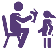
Std : V