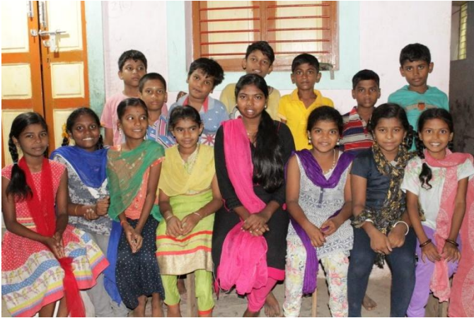
Std : V