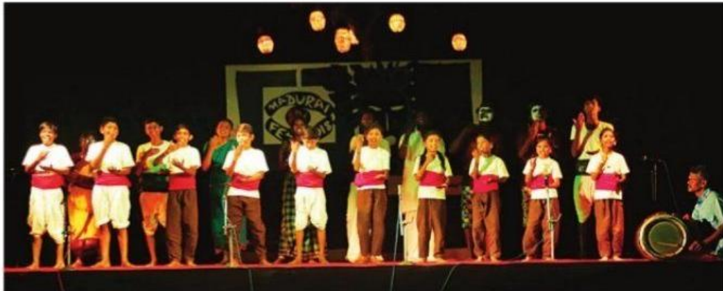
The talented group of young artistes entertain the audience at the fest

L ike they say, art is undeniably conducive to our happiness enabling to find ourselves and lose ourselves at the same time. The two-day art fest organised by Kaleidoscope Madurai, a centre for alternate and education, BASE, a research centre for artistic research and art-based philosophy and the Austrian Cultural Forum, New Delhi in Gandhi Museum last weekend, was one such soulful treat for the audience.