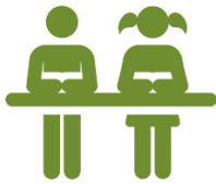
Std : VI