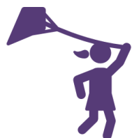
Std : II