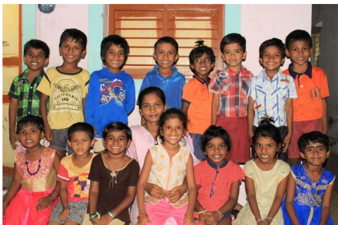
Std : I