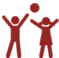
Std : IV