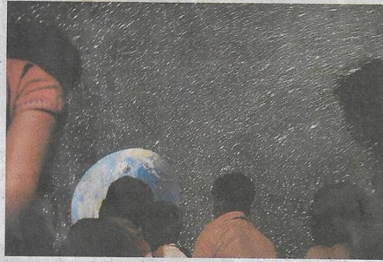
Edutainment: Students inside a mobile planetarium in Madurai on Monday.

The experience was curated by Spacetrek, a company that promotes immersive learning.