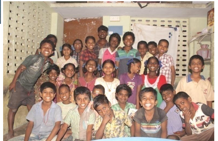
Std : IV