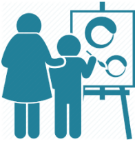
Std: II & III