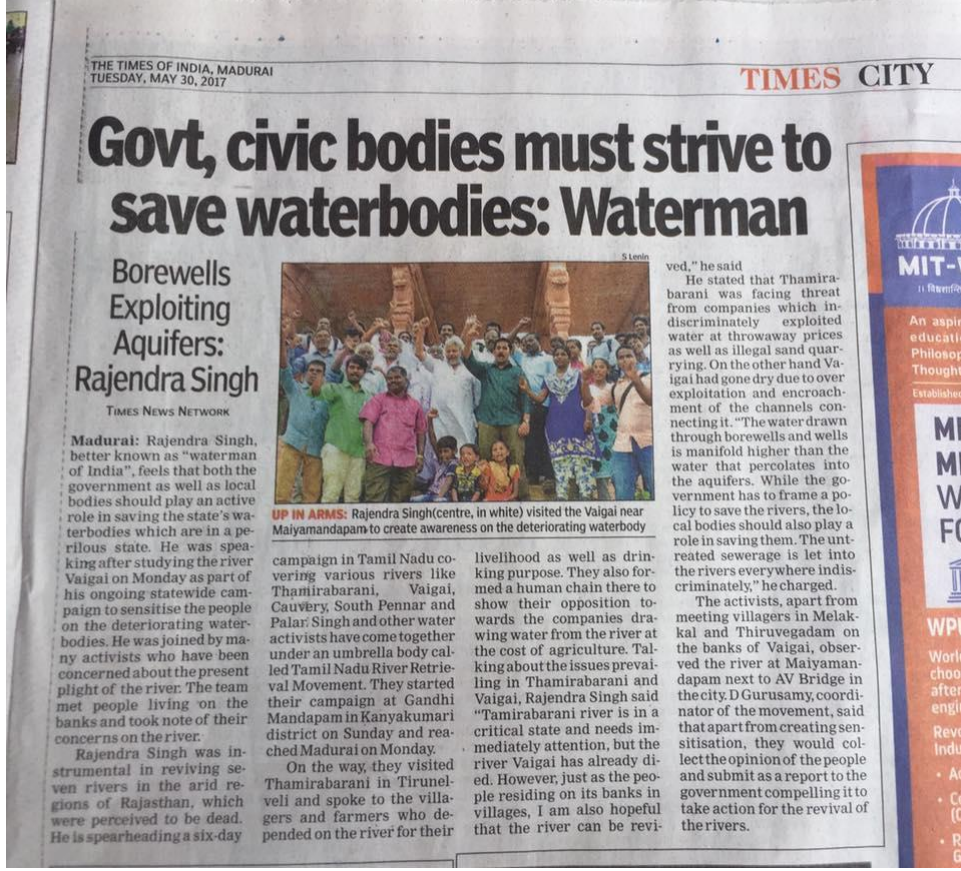
News about Vaigai River Restoration Meeting and Movement in Times of India (30.05.2017) and Tamil The Hindu (30.05.2017), Our children are in the photos